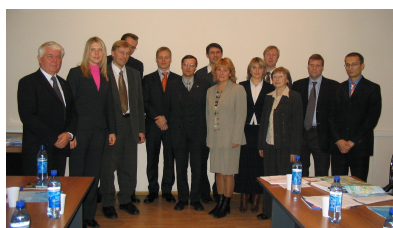
Project kick-off meeting on 31 October 2005

Furthermore, the project aims at enhancing cooperation between the city of St. Petersburg in Russia, Finland and Denmark in preventing and eliminating infringements of intellectual property rights, piracy and counterfeit.